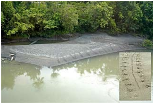
Figure 6. A typical riverine nesting beach for Carettochelys insculpta , Kikori River, Papua New Guinea. The distinctive tracks are clearly visible from helicopter.

billabongs and plunge pools of the Alligator Rivers region (Legler 1980, 1982; Press 1986; Georges and Kennett 1989). The preferred dry season habitat in the Alligator Rivers region is typified by Barramundi Creek (Legler 1982) and Pul Pul Billabong (Georges and Kennett 1989). Average depth was approximately 2 m but there were holes between 3 and 7 m deep. The substratum was sand and gravel covered with a thin layer of fine silt and litter. Fallen trees and branches, undercut banks, exposed tree roots, and local accumulations of litter provided a diverse range of underwater cover for turtles. The banks of the billabongs