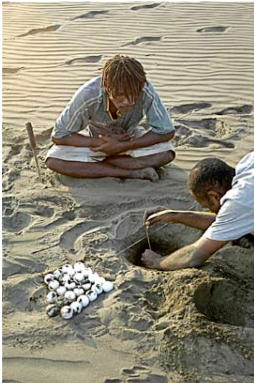
Figure 7. Carettochelys insculpta in Papua New Guinea nests on sand bars in the upper reaches of rivers, but also along the coast (as in this photo) where its nests are periodically inundated by the tides.

billabongs and plunge pools of the Alligator Rivers region (Legler 1980, 1982; Press 1986; Georges and Kennett 1989). The preferred dry season habitat in the Alligator Rivers region is typified by Barramundi Creek (Legler 1982) and Pul Pul Billabong (Georges and Kennett 1989). Average depth was approximately 2 m but there were holes between 3 and 7 m deep. The substratum was sand and gravel covered with a thin layer of fine silt and litter. Fallen trees and branches, undercut banks, exposed tree roots, and local accumulations of litter provided a diverse range of underwater cover for turtles. The banks of the billabongs